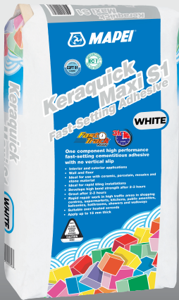
Keraquick Maxi S1 White

Mapei Australia Pty. Ltd 180 Viking Drive Wacol Qld 4076 Tel. +61-7-3276 5000 - Fax. +61-7-3276 5076 Website: www.mapei.com.au - Email: sales@mapei.com.au Manufactured in Brisbane - Australia