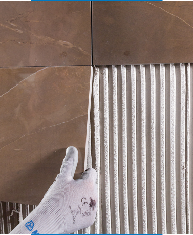
Installation of ceramic wall tiles