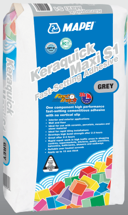
Keraquick Maxi S1 Grey